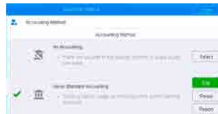
Xerox® Standard Accounting