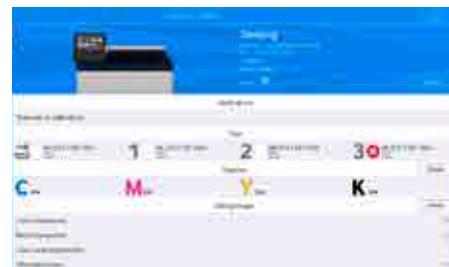
CentreWare Internet Services

Xerox® Standard Accounting also gives you a simple yet effective way to enhance network security, by limiting access and tracking use of your printer.