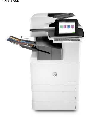
HP Color LaserJet Enterprise Flow MFP