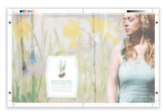
Oversize Output for A3 bleed

The Phaser 7800 colour printer gives graphic arts professionals an impressive range of business-ready finishing options to choose from. Depending on your needs and budget, you can go with the all-in-one Professional Finisher and get stacking, stapling, hole punching, booklet making and v-folding; or start with the Office Finisher LX and get stacking and stapling with the flexibility to add separate hole punching, creasing and stapling capabilities as your workload dictates.